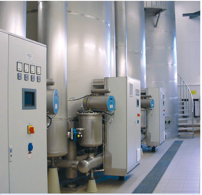
Compact drinking water plants (TWK) for water treatment with ozone

the ozonisation of water containing N,N dimethylsulfamide (DMSA). DMSA is a metabolite of the active agent tolylfluanide that is produced with agents used